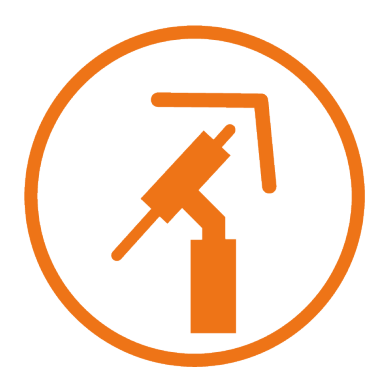
USABILITY MEANS EFFICIENCY

Unique and innovative handle flexibility moves the moment of load away from the welder's wrist